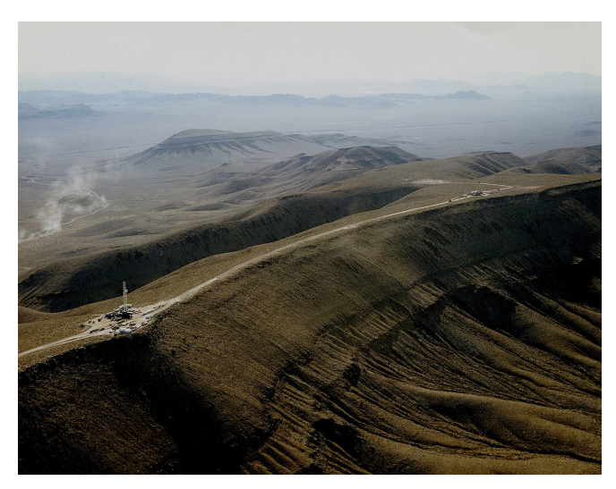
The crest of Yucca Mountain.

But it got a boost in 2013 when the U.S. Court of Appeals in D.C. forced the NRC to complete the longdelayed reports on the site's safety. Those reports started coming out shortly after court decision and the technical safety evaluations were completed this spring. They offered mixed statements on the potential safety of the site. Still, their release pushed the project back into the national conversation, and potentially back into play.