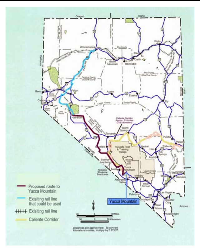
Map of the proposed Mina route.