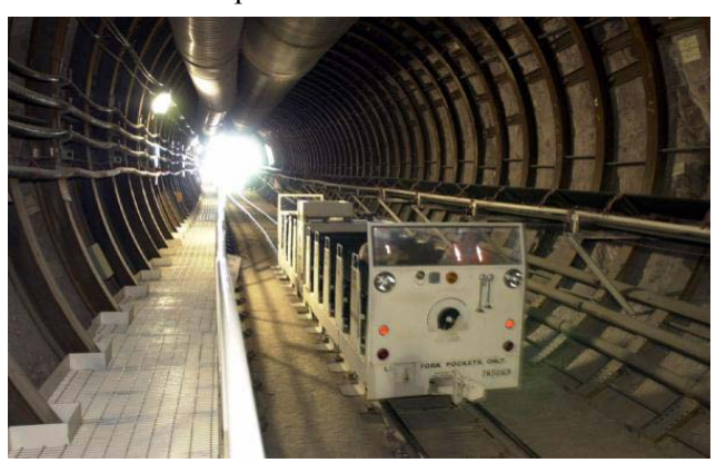
Inside Yucca Mountain

In October 2006, the Energy Department announced that it would prepare a supplemental environmental impact statement for the Mina Route. Public scoping hearings were held in October and November to gather comments regarding the proposed Mina route. According to DOE, work will also continue on the environmental assessment of the Caliente corridor. The two assessments are due to be completed in the summer of 2007.