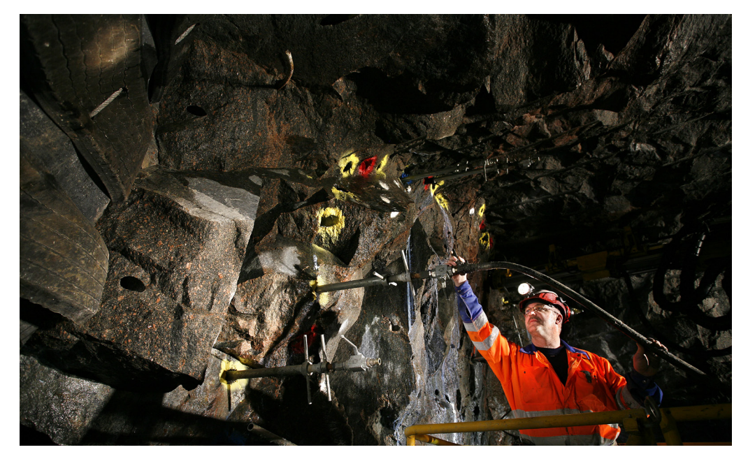
Determining the suitability of granite as a host rock.

combination of these rationales. In Sweden and Finland, efforts were concentrated exclusively on the granitic formations of the Baltic Shield, which underlies the vast majority of both countries (Sundqvist 2002). In their early attempts to identify a candidate site, the United States and Germany looked only at locations in salt formations. The United States investigated sites near Lyons, Kansas, and in the Permian Basin in the southwest. The Germans chose a site at Gorleben. Because of the