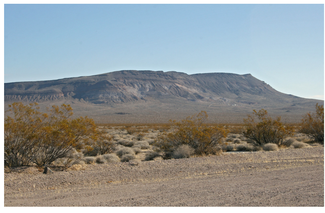
View of Yucca Mountain from Busted Butte.

The United States is the only country that has developed a safety case for disposing of HLW and SNF in a deep-mined geologic repository located in unsaturated volcanic tuff. That safety case was developed by DOE in parallel with the characterization of a specific site located at Yucca Mountain in Nevada. The safety case rests on two main pillars. First, engineered barriers minimize the amount of water that can come in contact with the HLW and SNF. Second, transport of radionuclides to the biosphere is limited by the amount of