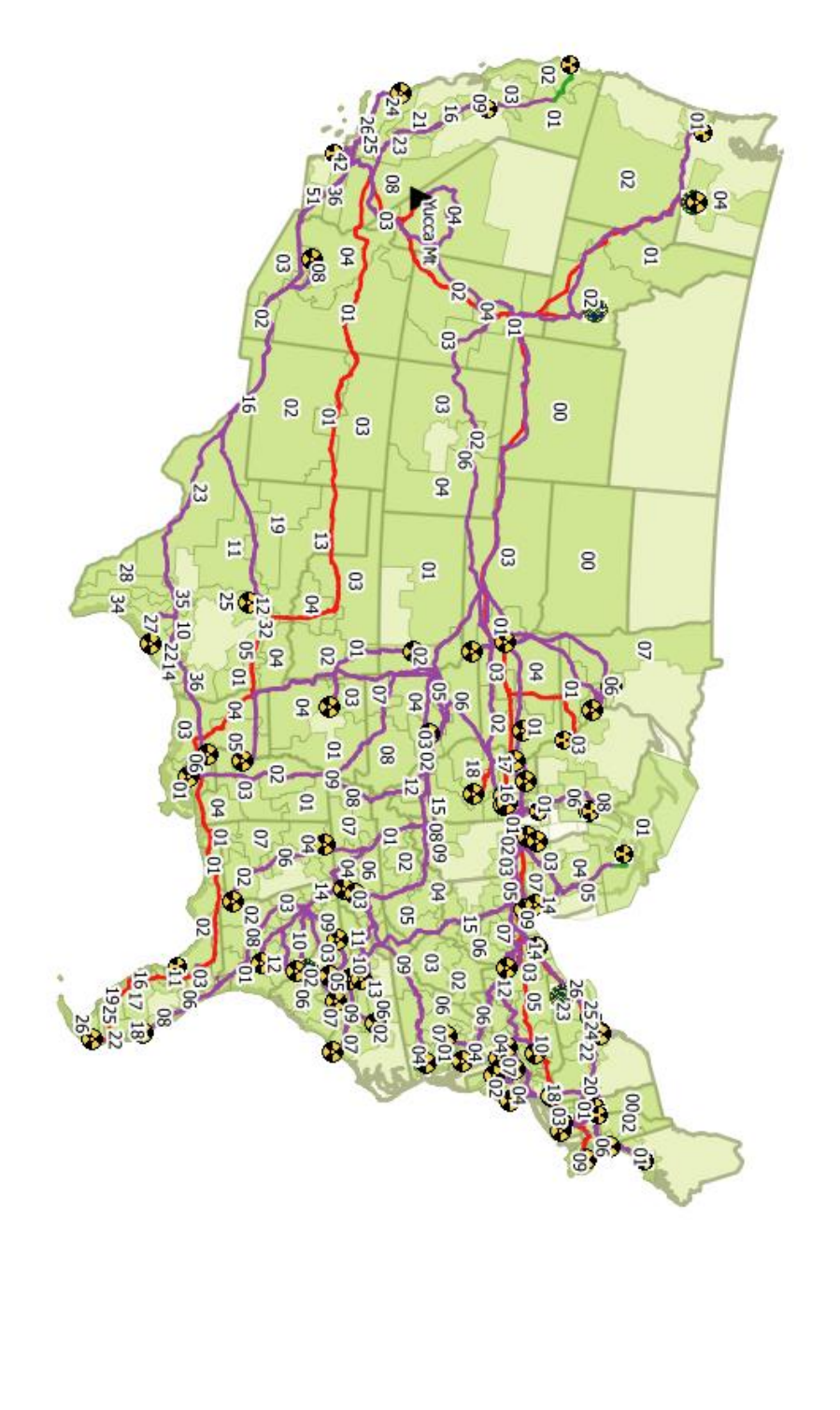
Figure 1. 115th Congressional Districts Affected by Rail and Truck Shipments to Yucca Mt