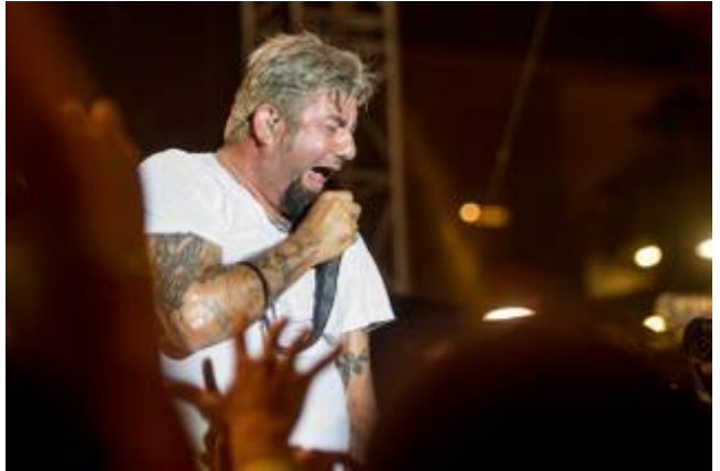
Deftones and Rise Against in Concert