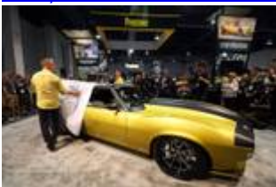
2017 SEMA Show