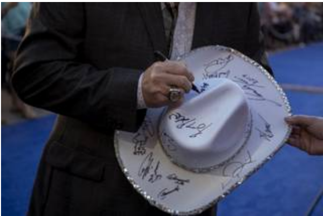
2017 PBR Round 1