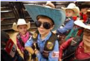
2017 Miniature Bull Riders World Finals