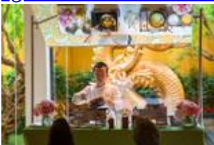
Wynn Master Class Series at Wing Lei More photos »