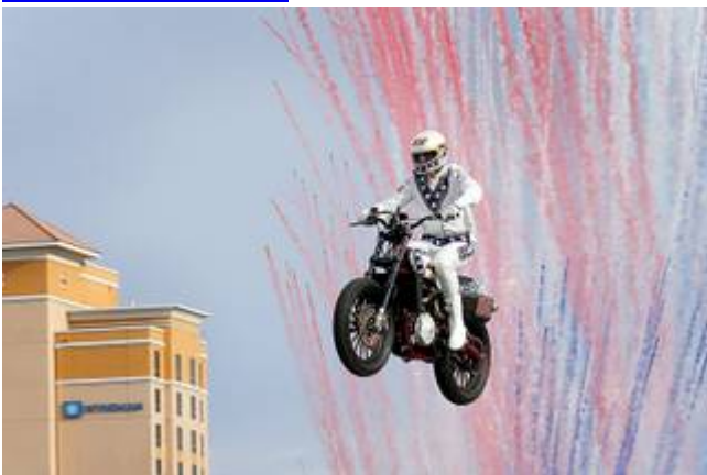
Travis Pastrana Nails Three Iconic Evel Knievel Jumps