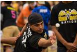
13th Annual World Series of Beer Pong