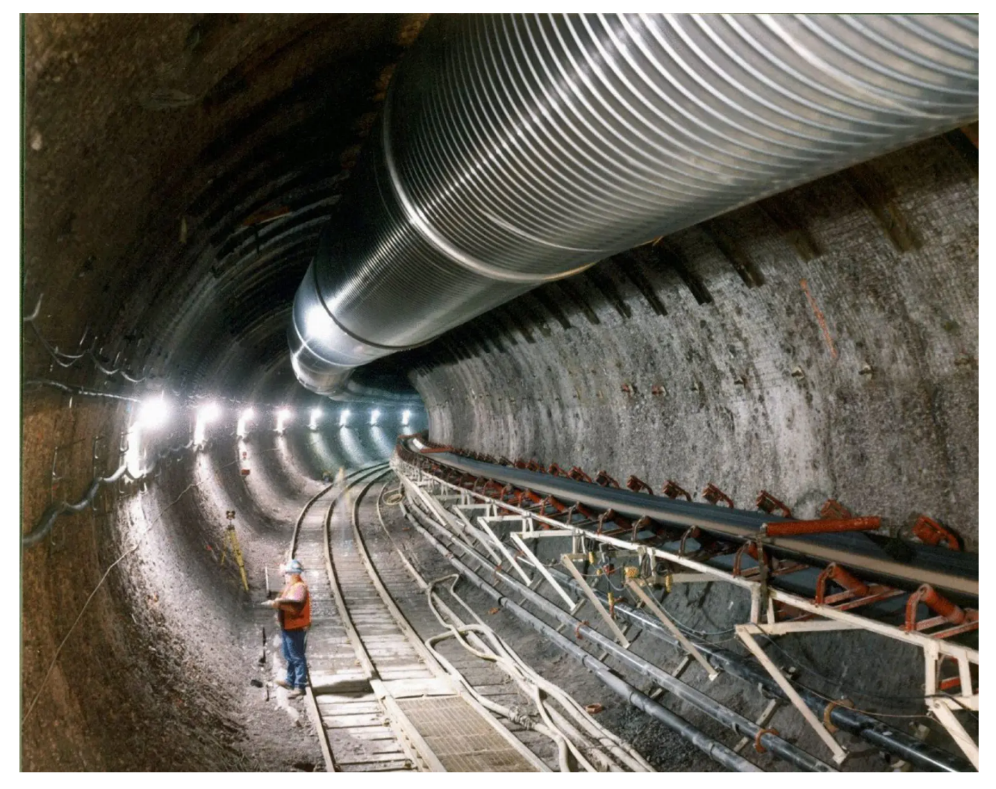
The Energy Department dug this 25-foot-diameter tunnel under Yucca Mountain to explore its potential as a nuclear waste repository.

As with much policy-setting in the Trump administration, a single tweet from the president on February 6 appeared to reverse a previous stance. The message about Yucca Mountain, the nation's proposed geologic repository for spent nuclear fuel and other high-level radioactive waste, set the media alight with speculation about new actions in US nuclear waste policy. But has anything changed, really?