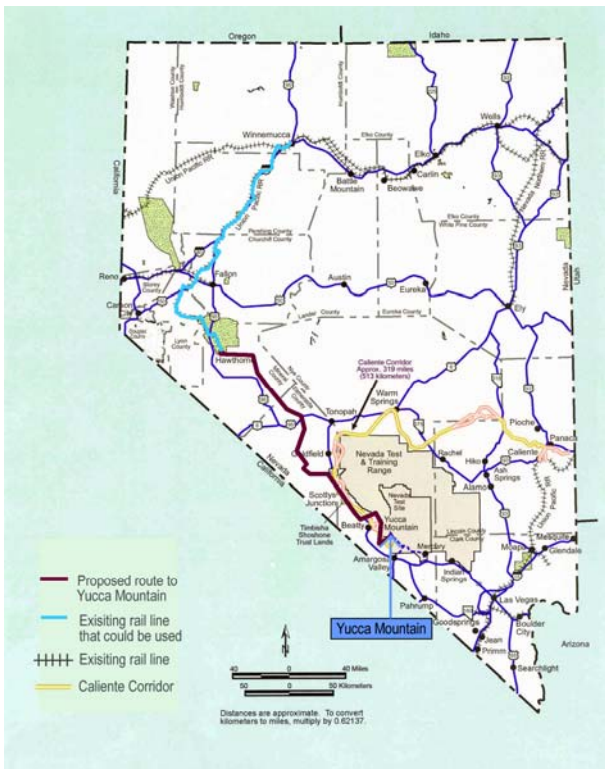
Map of the proposed Mina route.