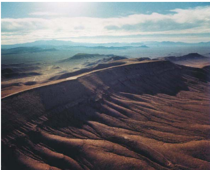
Aerial photo of Yucca Mountain.

According to this timeline, DOE anticipates that the