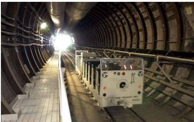
Inside Yucca Mountain

In October 2006, the Energy Department announced that it would prepare a supplemental environmental impact statement for the Mina Route. Public scoping hearings were held in October and November to gather comments regarding the proposed Mina route. According to DOE, work will also continue on the environmental assessment of the Caliente corridor. The two assessments are due to be completed in the summer of 2007.