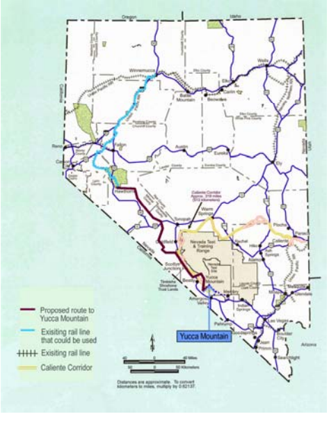
Mina Route: see page 2 for larger graphic

DOE had previously considered the so-called Mina route in the 1980s and early 1990s, but shelved plans for further study of the corridor when the Walker River Paiute Tribe informed the department that it would not allow high-level radioactive waste to be shipped through its reservation. However, the tribe reversed its earlier decision in April, stating that it will allow DOE to consider a rail route across its land.