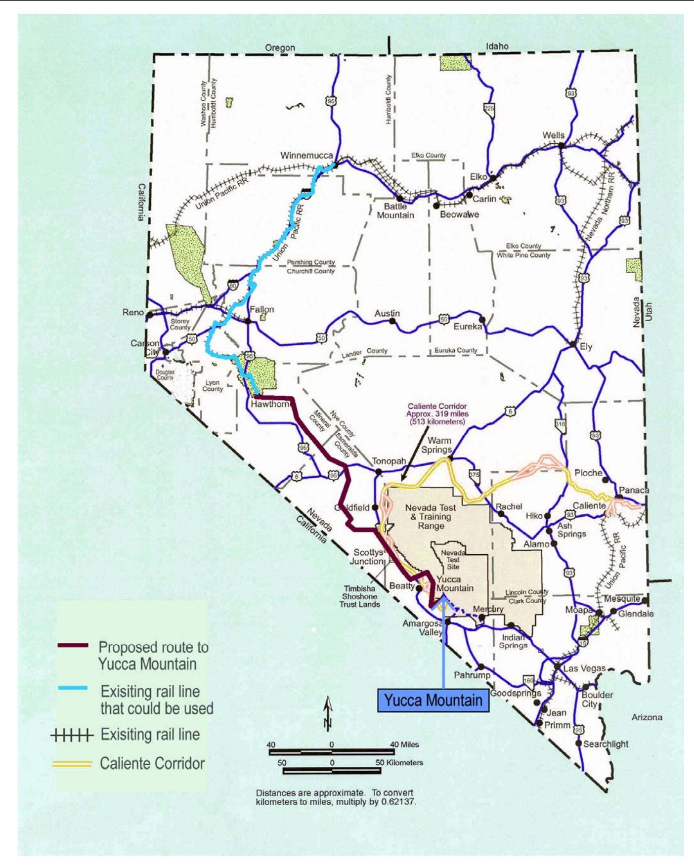
This map shows the Mina corridor now under consideration (shown as "proposed route to Yucca Mountain") as well as the Caliente Corridor.