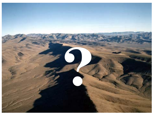
Yucca Mountain, Nevada

The Yucca Mountain site is now effectively closed. In May 2010, DOE ordered the Yucca Mountain project's main contractors to stop all work, with the exception of preserving records. Then, on October 1, 2010, the Office of Civilian Radioactive Waste Management—the organization within DOE responsible for the Yucca Mountain program—was formally disbanded, with responsibility for waste disposal activities transferred to DOE's Office of Nuclear Energy.